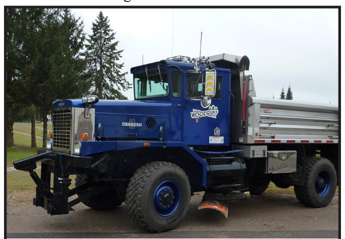
Wisconsin's town governments regularly use BCPL's Local Government Trust Fund Loan Program as a trusted and reliable source of funding for needed capital purchases. The Town of Woodruff in Oneida County financed the purchase of their plow truck and dump box package.

In 1871, the state legislature authorized BCPL to create the Local Government Trust Fund Program. Today, more than ever, one of the strengths of the BCPL is its constitutionally mandated obligation to serve as a source of competitively-priced financial loans for municipalities and school districts to support public projects. Beyond the annual distributions to local schools is the agency's ability to work hand-in-hand with boards of local government in every corner of our state. To give you an idea of the scope and relevance of the BCPL Local Government Trust Fund Program, consider that in the past two years, 378 new loans have been made. Of this total, 118 loans totaling $51.2 million were made to